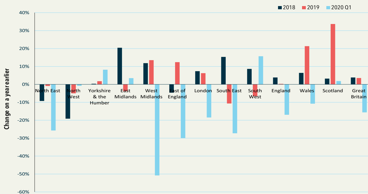
Chart 2: Residential planning approvals by region (No. of units)

N.B. Includes residential projects of all sizes, residential units on non-residential schemes and conversions.